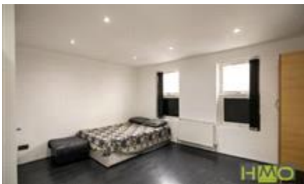
R3 Hillside, Slough £950 pcm