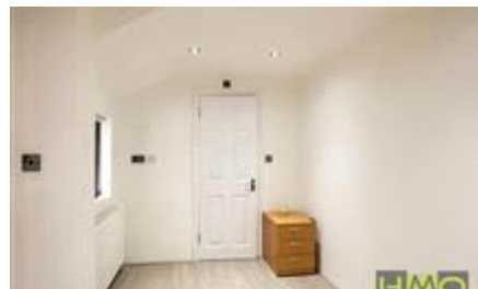
Ensuite Rooms in 4 bedroom shared house SL1